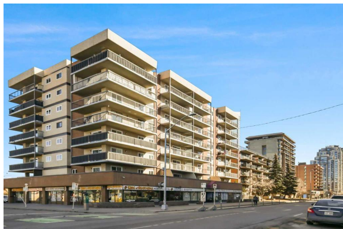
502, 1334 12 AVENUE SW RECA MEASUREMENT STANDARD - CALGARY AB MAIN LEVEL (AG) - 901.32 Sq Ft / 83.73 m 2 TOTAL ABOVE GRADE RMS SIZE - 901.32 Sq Ft / 83.73 m 2

**Hold on to your Hat** Value!!! Shop & compare. Indoor parking! Plus, 2 months prepaid condo fees! Views overlooking the downtown and the west side. This is the most popular model/floor plan with 900 square feet in the sought-after "The Ravenwood" concrete building with two bedrooms, a bathroom, one indoor heated parking space, newer countertops, an oversized covered balcony, and a remodeled kitchen & modern design. Additionally, the property features upgraded laminate flooring (no carpet), in-suite laundry, newer windows, bathroom fixtures, and appliances. Large Primary bedroom with a closet. Titled parking in a secure, heated underground parkade. You are also within walking distance of anything you need, with the Sunalta LRT just minutes away for added convenience. Close to Sunalta Elementary School, Connaught School, and West Canada High School, the Bow River pathway offers access to medical facilities, shopping, grocery stores, coffee shops, and much more. QUICK May 01, 2025 possession is available - ACT FAST! You can call your friendly REALTOR(R) to book you viewing.