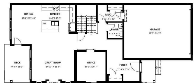
MAIN 1,085 SQ.FT. GARAGE 477 SQ. FT.